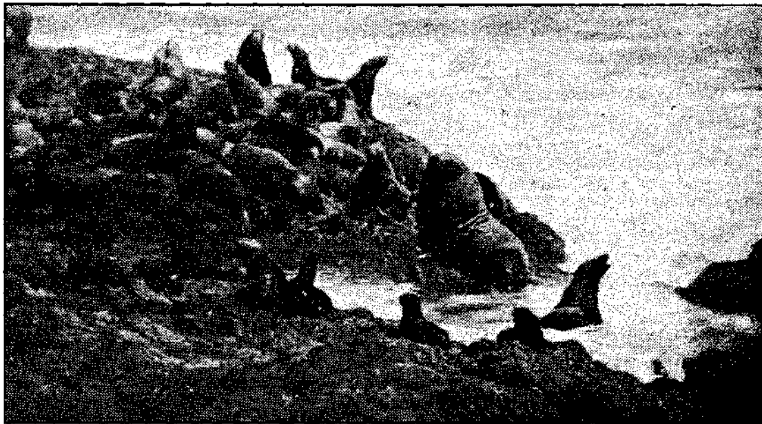
Sea lions, Seal Rock, San Francisco, California