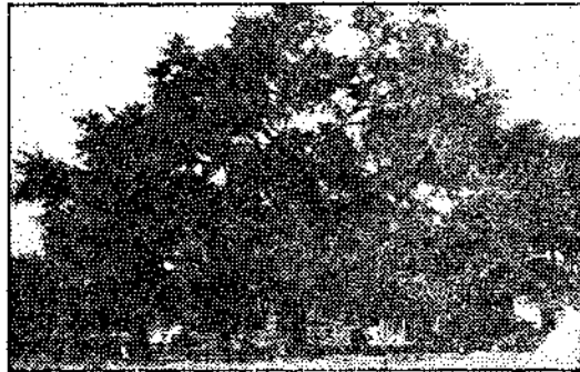
Live oak at Sloane's ranch, Santa Maria, California

The cactus, once a nuisance, is now grown as a crop on 1,000,000 acres in Arizona. The juice is widely used for soaps, cleaners, boiler compounds, water softeners, drugs and candy.