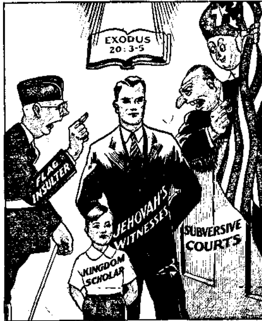
Only a man with a conscience can be a true patriot

Today you have liberty of conscience provided there is no law with which your conscience may come into conflict. If you follow