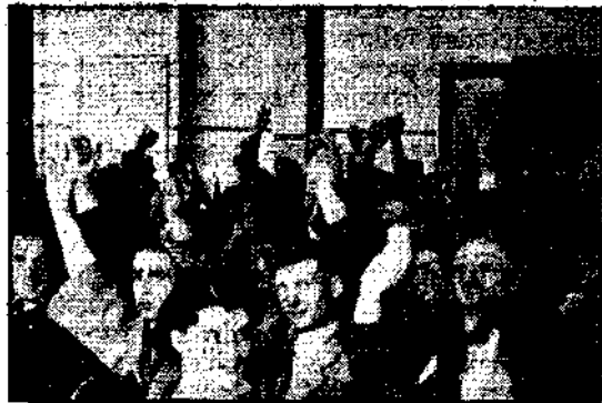
At Montreal Kingdom Hall, answering the question "How many ex-Catholics are in the audience?" —A 90-percent showing of hands

Now, a month since the trial, only one of the seventy-odd newspapers of the United States which blared forth evil and false reports about the Lord's servants has carried an account of