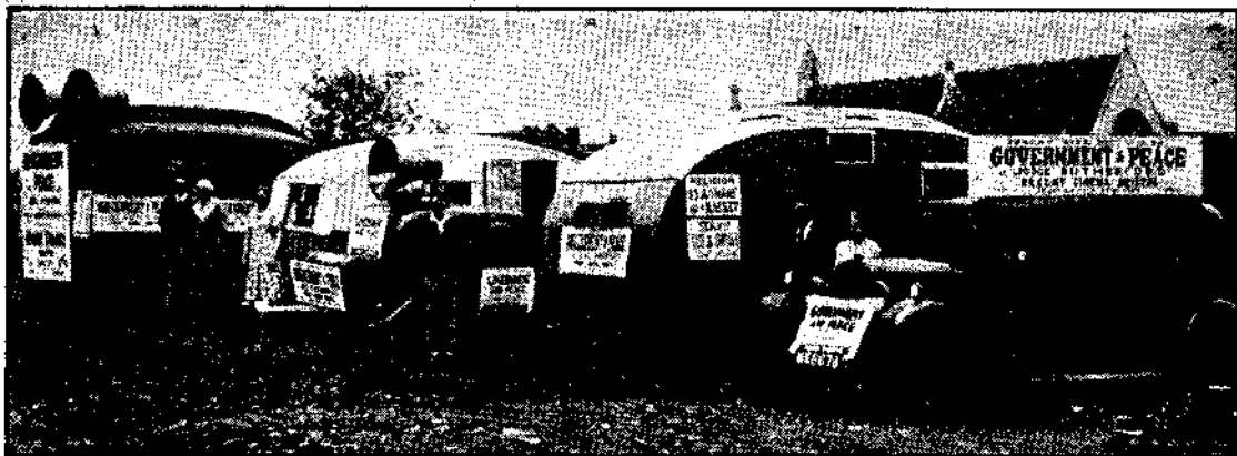
Trailer camp at Bristol, England

false witness, as denounced in the Bible book of Deuteronomy. In New York city the so-called "Coughlinites", according to circumstantial evidence set forth in many publications, have definitely been using this technique on Jews for several months past. A refinement of the same system was planned for Madison Square Garden. Witnesses at the trial of the three ushers above mentioned plainly presented the facts to the court, that a group of several hundred Coughlinites walked from radio station WMCA, after they had finished picketing that station for refusing to broadcast Coughlin's speeches, and entered the Garden, all seating themselves in the rear top balcony, just behind the speaker's platform.