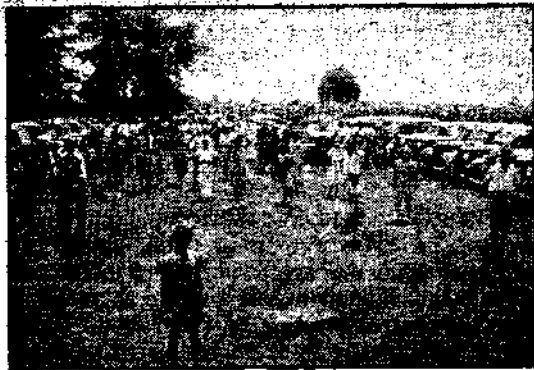
Jehovah's warriors, 126 strong, relaxing after the battles of Mansura, Bunkie and Marksville, La.

One not familiar with the procedure in New York courts, or not having an appreciation of the vast number of cases which must be disposed of in those courts, can hardly understand the difficulty of getting in all this testimony in a case of simple assault. Be it said for the judges, that although impatient with defendants' attorney when he plainly showed them why consideration ought to be given to the type of the meeting, and to what plans had been made to provide for the public and assure their safety, those judges consented to listen to the evidence for nearly two days. Indeed, these ushers were in the lions' den, as was Daniel, because this court is one which customarily convicts. But the Lord having promised that He will deliver those who put their trust in Him, and since His name was involved in the great proclamation that issued from Madison Square Garden, the three ushers left the courtroom praising the Lord for having had a part in honoring His name and acting for its vindication. Two of the three ushers were wholly acquitted, and the third one, whose accuser failed to appear in court, was unconditionally dismissed by the court.