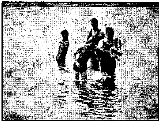
Immersion scene at Montreal, Quebec

Now let the responsible parties of the news sheets that take sides with the enemies of Jehovah call to mind that it is plainly stated in His Word that the wicked He will destroy. (Psalm 145:20) Among those wicked are the perjurers and false witnesses. (Proverbs 6:16-19; Deuteronomy 19:16-19) If they wish to do right they can explain to their readers they formerly deceived that Jehovah's witnesses did not provoke a brawl at the Garden, nor did Judge Rutherford make one single aspersion on the Catholic Church which caused the outbreak, but that the whole disturbance was prearranged by conspiracy; and that the action of the ushers was to resist law-breakers and defend the responsibility Jeho-vah had imposed on them. A Court of two Catholics and a Jew found that Jehovah's