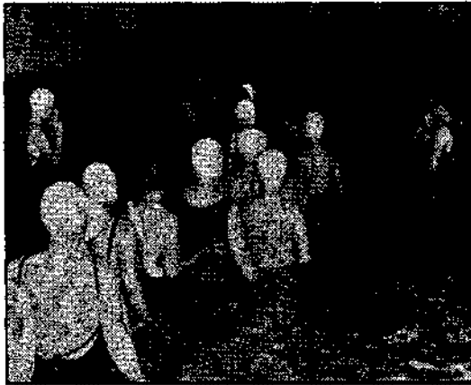
Immersion of Jehovah's witnesses at Los Angeles, California