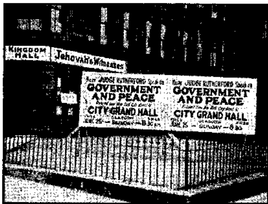
Jehovah's Kingdom Hall, Glasgow