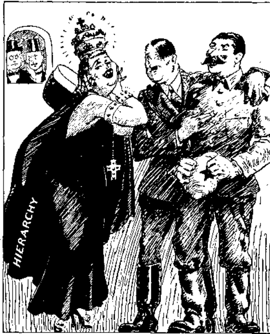
A crown-jewel-collector from the Kremlin meets a new prospect

I believe I am today acting in the service of the Almighty Creator. By warding off the Jews, I am fighting for the Lord's work.